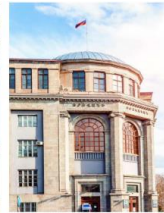
Clinic of Cardiology, Heratsi Hospital (CC HH YSMU, Armenia)