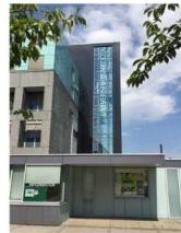
Clinic of Cardiology and Angiology (CCA, Germany)

Wednesday, May 3 rd 2023, at 2:00 PM (Berlin Time) at 4:00 PM (Yerevan Time)